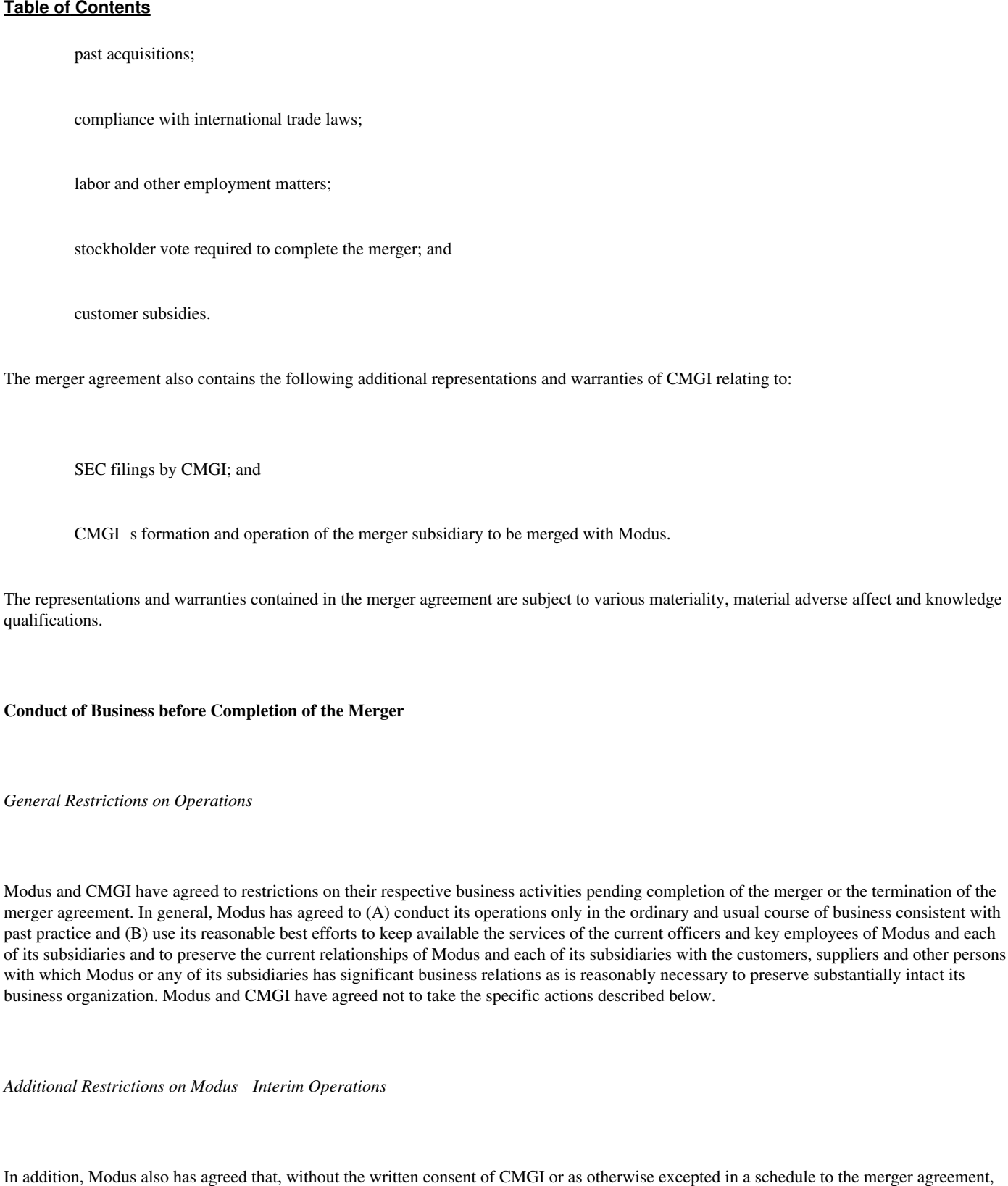
Table of Contents 98

Modus will not and will not permit any of its subsidiaries to: